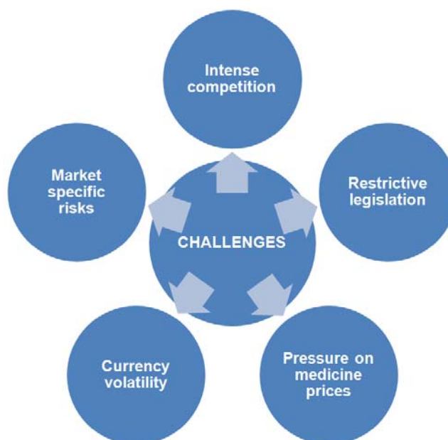
Fig. 2. Aspen “challenge themes”