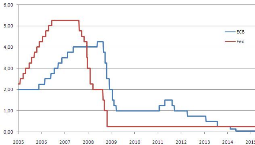
Fig. 1. Fed funds rate for the Fed, main refinancing rate for the ECB

Following this argumentation, investors should be indifferent between using the current exchange rate ER_t and investing in the U.S., thus, earning I_{US_t} or investing in the Euro area earning I_{EA_t} and transferring the whole investment after maturity at the today expected rate in the next period E_t ER_{t+1} 1 . Simply rearranging, the assumption of rational expectations and delay equation (1) by one period leads to: