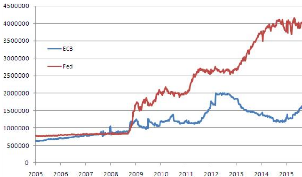
Fig. 2. Monetary base of the Fed and the ECB

three years. This is also the reason why the monetary base in the Euro area has fallen since the end of 2012, because the liquidity provided is repaid by the financial institutions. However, with the QE-program announced in January 2015 and its subsequent prolongings, the ECB balance sheet is expected to increase even further until the end of 2017.