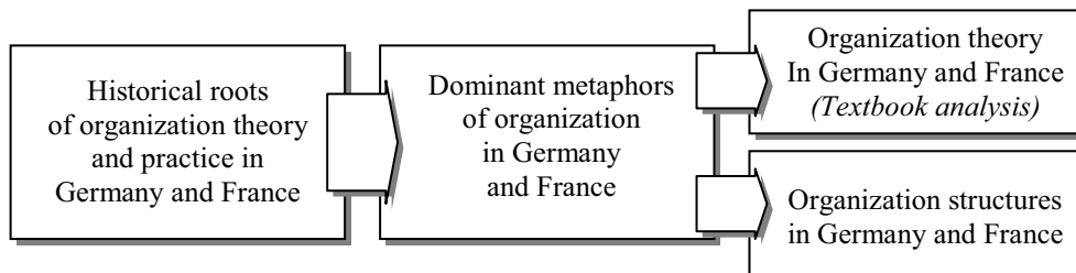
Fig. 1. Argument chain of the study

The differences between the images that underlie the way German and French scientists and practitioners approach organizations may basically be reduced to two metaphors: chart and sail. In German organization theory and practice there is a dominant image of an organization as an essentially centripetal entity and as a structure for the efficient differentiation and integration of individual tasks with a view to a common, tangible goal. French organization theory and practice, however, is predominantly determined by an image of an organization as a temporary arrangement and common guiding image for its various interested parties towards the achievement of a given goal.