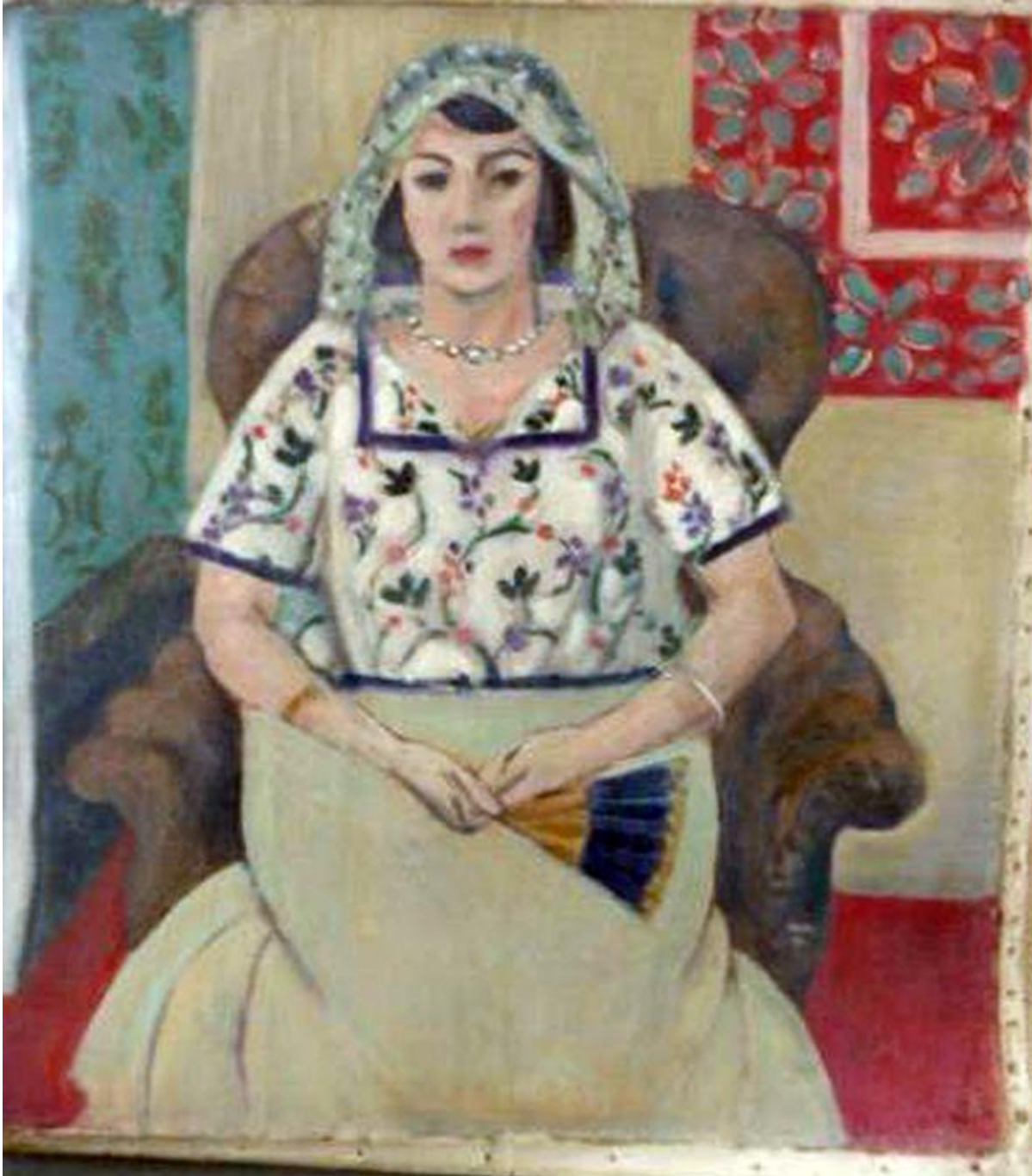
Figure 1. Matisse's "Seated Woman"

Speer allowed for the confiscation of art that ended up in the collections of such individuals as Speer, with greater amounts going to such Nazi leaders as Herman Goring (Winter, 2013). A notable painting was Matisse's "Seated Woman" (1921). This masterpiece was one of many art works he acquired through theft, an art work eventually reunited to its rightful owners (NPR, 2015).