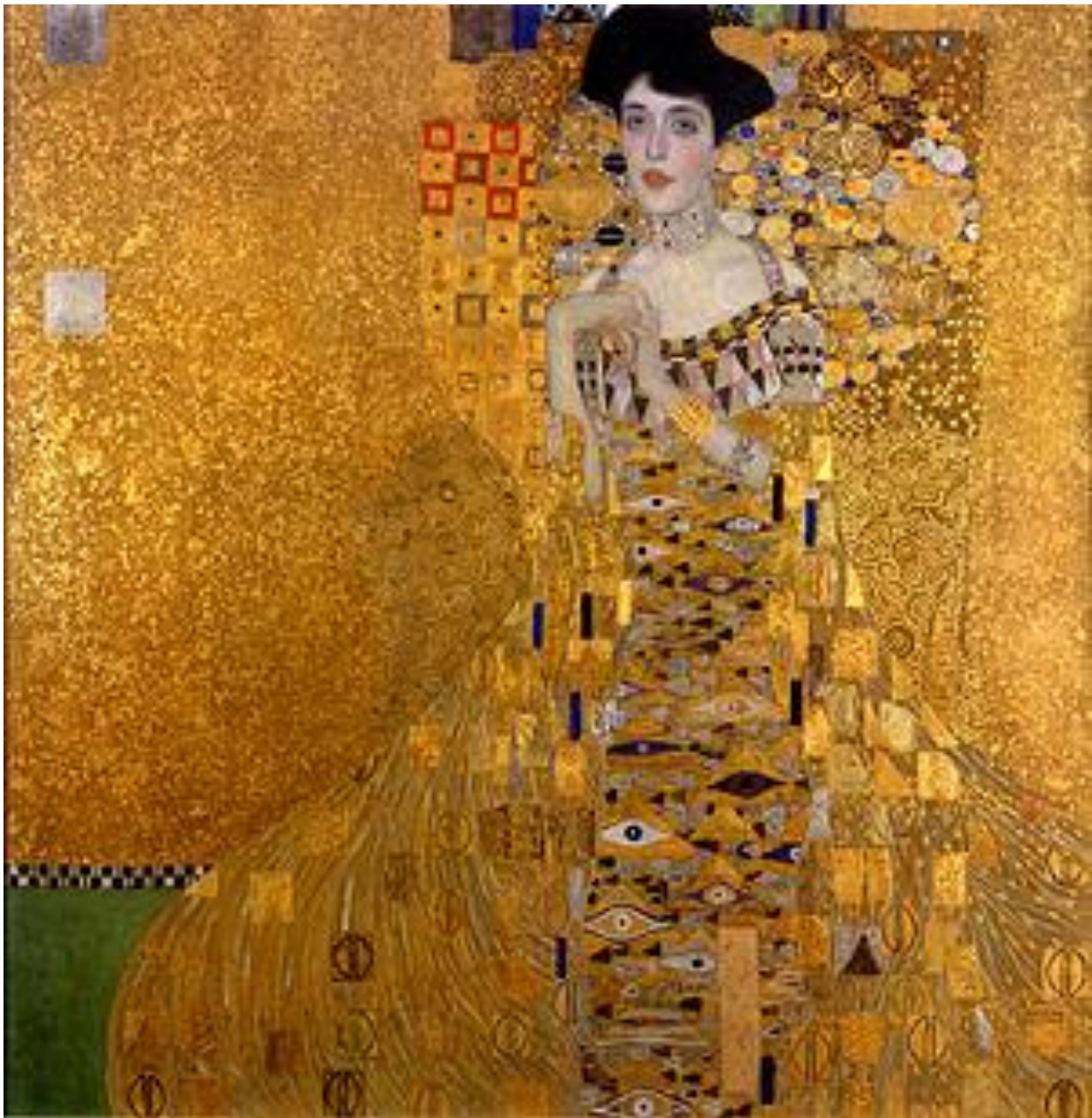
Figure 3. August Klimt's "Portrait of Adele Bloch-Bauer I"