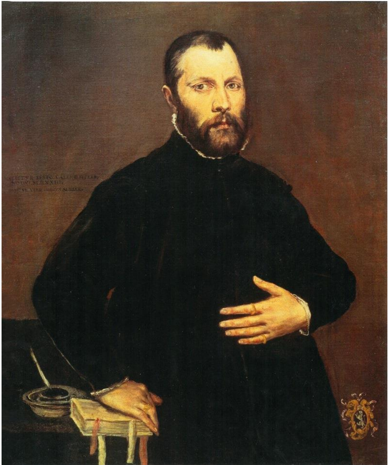
Figure 2. El Greco's "Portrait of a Gentleman" (1600)