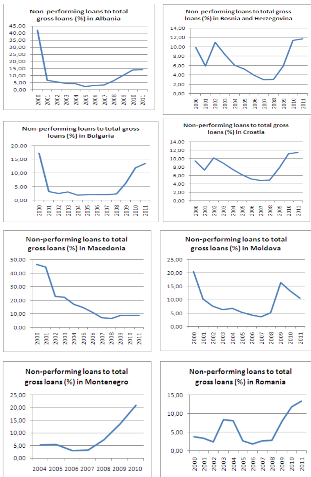
Fig. 1a. Non-performing loans to total loans in Southeastern European banking systems