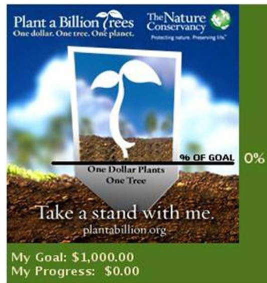
Fig. 2. Positive emotion advertisement

tisement with positive emotion intensity. Both advertisements stimulated participation interest for their respective causes.