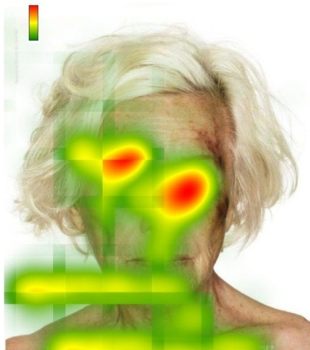
Fig. 3. Heat map negative emotion advertisement

The heat map results indicated that the photo in Figure 3 was fixated on much more frequently as was the same for the photo in Figure 4 compared to other advertisement features. These gaze durations may suggest that photos generate much expected interest and importance in advertisement design. Similarly, the text and sponsor identification were prominently attracted as well. However, such results may also indicate that some areas of the advertisements are attracting minimal attention while others are stimulating too much. Thus, this sample encourages future analysis using a much larger sample pool which combines eye tracking data with emotion intensity and donor intention measures. The additional research may offer a more comprehensive and in-depth perspective for