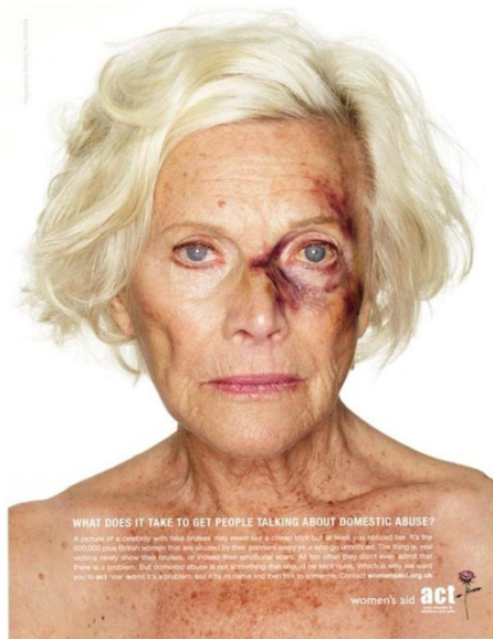
Fig. 1. Negative emotion advertisement

further questioning indicated that Figure 1 was exemplary of a negative emotion intensity advertisement. In contrast, Figure 2 displayed an adver-