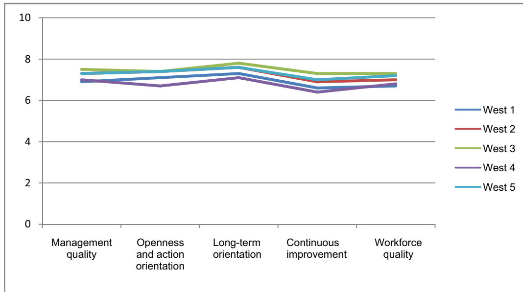
Fig. 3. The HPO scores for the five operational units

A likely explanation for people's shared opinion on the organization is that everyone, irrespective of their unit, operated in the same context: they all used the same management systems, products, processes and IT systems. This ties in with research by Stede (2003) and Zagersek et al. (2004), who found that management practices in an organization predominate regional cultural differences, which means that all organizational units operate in principle in the same uniform manner. As regards the case company, all units also operated in the same manner and different HPO scores may be assumed to be explained by differences in the quality of staff and differences in behavior and focus on spe-