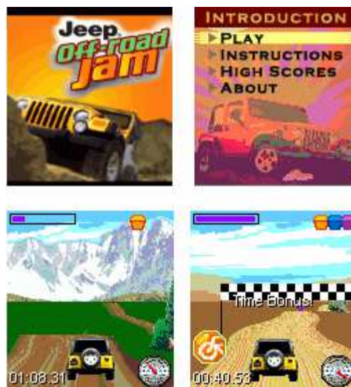
Fig. 3. Jeep Off Road Jam developed for DaimlerChrysler by Thumbworks

Even clearer cut example of m-advergame is the DaimlerChrysler Jeep Off Road Jam in which players can upgrade their cars from Wrangler to Sport Jeep to even to Rubicon by excelling in the game (see http://www.thumbworks.com/apps/jeepoffroadjam.shtml ). The game was developed by a Thumbworks that is one of the m-advergame developers. Figure 3 provides an illustration of the Jeep Off Road Jam.