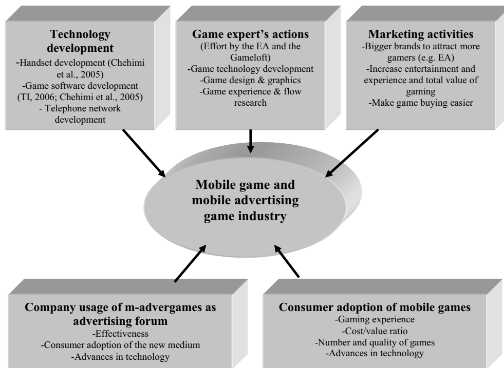
Fig. 4. Factors influencing mobile game and m-advergame industry

The future of mobile games and m-advergaming seems to be very promising. There is a plethora of issues that impact the development of mobile game and m-advergame industry. Figure 4 outlines the main issues that will impact the development of the mobile gaming market.