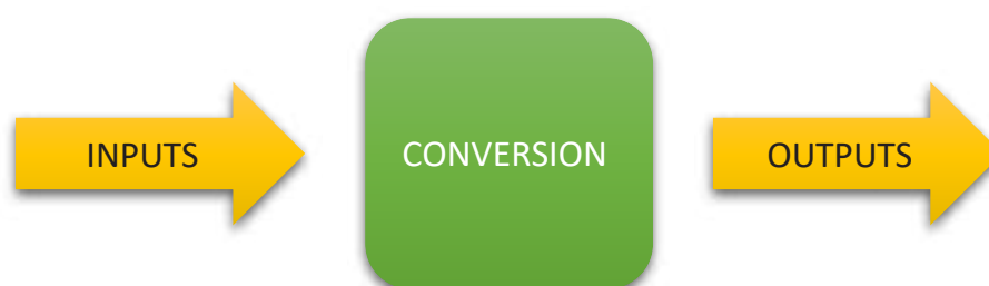
Figure 1. The simple system model