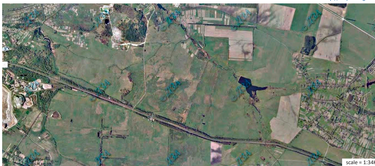
Figure 2. Orthophoto image of key plot 1