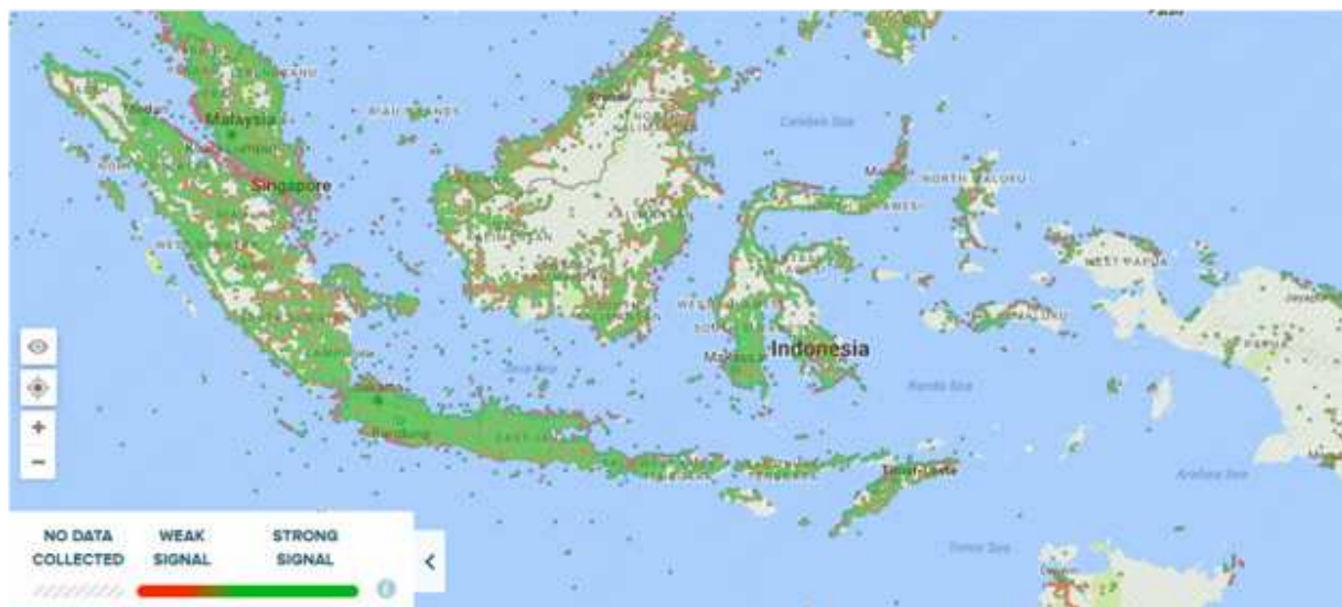
Figure 1. Digital infrastructure map of Indonesia

structure on other islands range from 4 to 7 million people. It seems that they simply ignore those who are living on the other islands, not to mention those in the remote and outer areas.