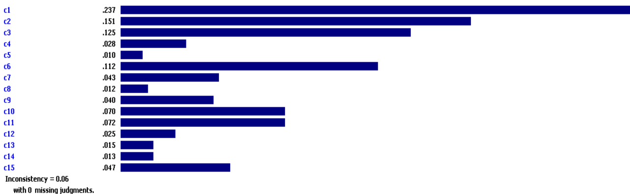
Fig. 2. The output of EC software

As shown in the figure, the incompatibility rate 0.06 is acceptable and indicates the validity and reliability of the obtained results. According to the obtained results, it can be shown the