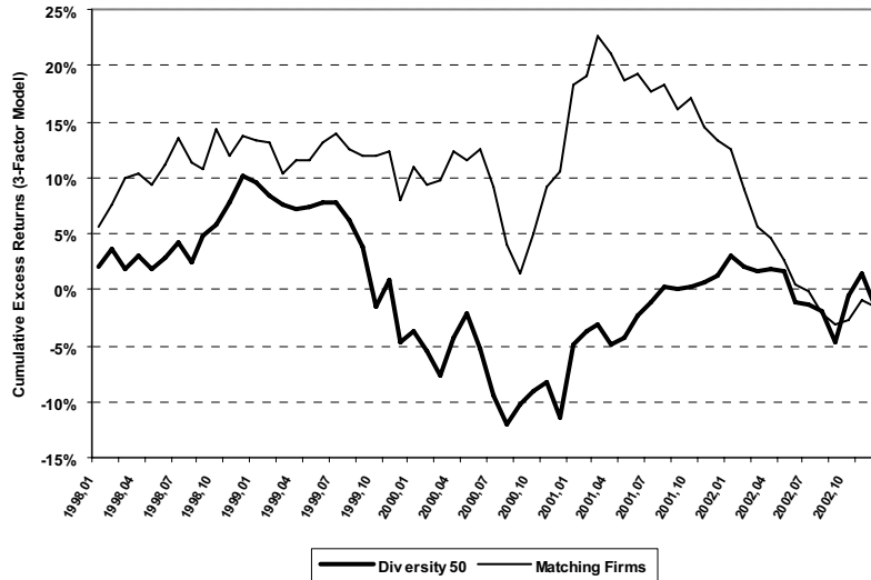
Fig. 1. Cumulative Excess Returns from a 3-Factor Model: Diversity 50 vs. Matching Firms