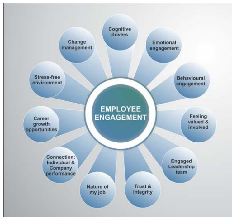
Fig. 1. A theoretical model to measure employee engagement

4.12. Theoretical model of employee engagement. Based on the theoretical study and the identified constructs (as per Table 1) the theoretical model of employee engagement is presented in Figure 1.