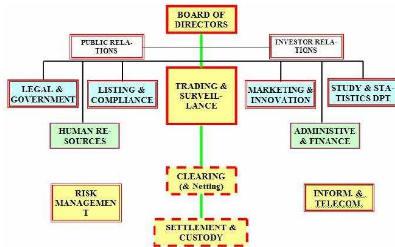
Fig.2. Reference organisation chart of a stock exchange

2.2. Advantages of consolidation. 2.2.1. Avoiding duplications. There are four areas where consolidation has a strong impact: Trading & Surveillance, IT department, Administrative & Finance, and Risk Management.