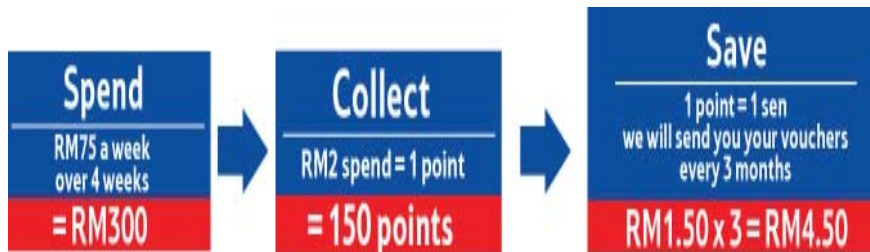
Fig. 1. Example of reward point redemption program offer by Tesco

expire. Every quarter, if customers have collected 150 points or more, Tesco will send clubcard cash vouchers to customer. The reward point is 1 point for every RM 2 customer spends in store and each point is worth 1 sen. Figure below shows the example of reward point redemption program.