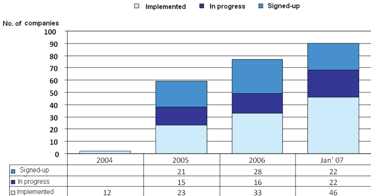
Fig. 1. RosettaNet adoption in Malaysia

Notes: Implemented – SMEs in Malaysia who have gone with at least one system implementation. In Progress – SMEs in Malaysia who have started the process by buying software, hardware etc. SMEs in Malaysia with approved RosettaNet Grant application. Signed up – SMEs in Malaysia who have applied the RosettaNet Grant. SMEs who have signed agreement with Solution Providers.