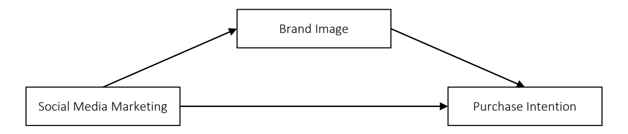
Figure 1. Research model

gated this relationship within brand image mediation. To address this research gap, this study formulates the following hypotheses: