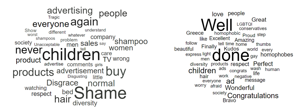
Figure 1. Negative and positive word cloud for the campaign launched in Greece

ful, thank, love, people, message, see, and representation." Hence, positively predisposed American users praised the brand's message and efforts to increase the visibility of gender minorities. Furthermore, positive comments appeared to emphasize positive emotions and inclusivity.