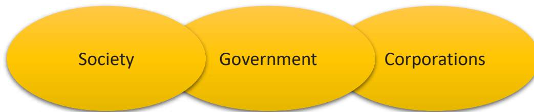
Figure 2. Interests linkage among the corporations, the government and the society

enced by organizational efforts in realizing their goals. The main stakeholders are those who have a contractual relationship with the organization and are influenced by the actions of the organization, even though they have no contractual relationship with the organization. The contractual relationship of the company as a corporate taxpayer with the government and society can be seen in Figure 2.