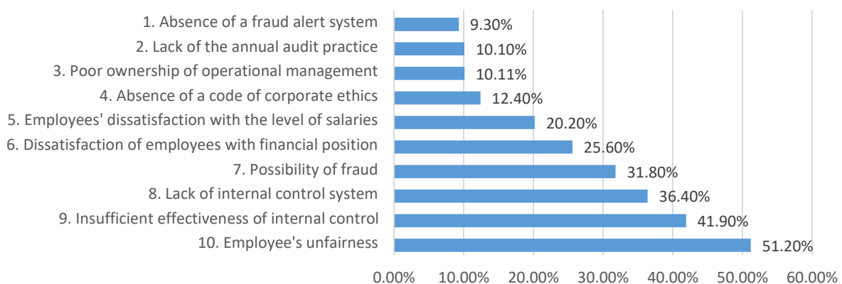
Figure 3. The factors promoting swindling at Ukrainian enterprises, 2016