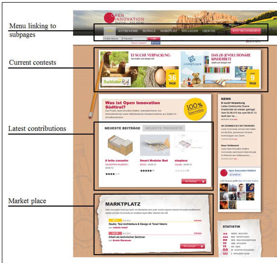
Fig. 2. The OIS innovation platform

Each competition is set up and supervised individually by the open innovation intermediary (LVH), consisting of a team of consultants and experts in the open innovation field. Depending on the contest topic, adequate target groups are identified and addressed to participate in the innovation contest community. To provide a better understanding of the platform, the following paragraphs illustrate the OIS community in more detail. The intermediary OIS platform is based on three central components: the community, the contests, and a market place. Figure 2 shows the starting page of the OIS platform.