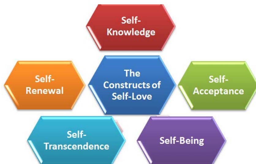
Fig. 1. The constructs of self-love model

Based on the synthesis and deconstruction of the meaning of self-love from the literature review, five constructs of self-love were formulated, namely: Self-Knowledge , Self-Acceptance , Self-Being , Self-Transcendence and Self-Renewal .