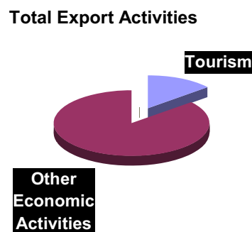
Fig. 1. Tourism Share in Total Exports in South Africa (WTTC, 2004: 6)

Tourism encompasses a whole range of economic opportunities which have an impact on many different social and economic sectors, transport and communications infrastructure, water supply and sanitation, education, public security, cultural services, immigration and customs – as well as accommodation providers and their suppliers. Reflecting the diversity and complexity of the industry, it is one of the few sectors where development master plans are still produced. There is much scope for increasing the emphasis on pro-poor economic development in these plans (WTO, 2001c: 59-60).