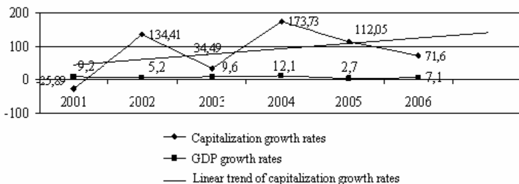
Fig. 2. The rates of growth dynamics of market capitalization and GDP in Ukraine

In comparison with rate of growth of countries' GDP with the maximum meaning 12,1% in 2004 the rates of growth of market capitalization are much greater. Moreover, the indices behavior in different years doesn't correspond with each other. Despite considerable variations in the dynamics of market capitalization index the built linear trend is the evidence of market capitalization growth.