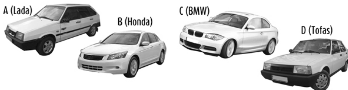
Fig. 1. Car models used as stimuli

For the second stage, four models by each brand were selected. In order to select appropriate model, a keyword search was utilized to identify available models for each brand in the market. The model that was most frequently returned by the keyword search was selected as the stimulus for that particular brand. The rationale behind this procedure is that the most frequent returned model is more likely to carry the representational appearance characteristics of the product for the present day. Next, a photographic image for each model was selected based on the representative quality. In this context, all images showed the automobiles from right-front angle against a white background. To eliminate the effect of color on emotional response, all automobiles selected were white.