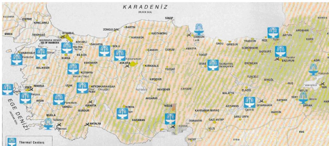
Fig. 1. Location of the most known spas in Turkey

The investments in the area of thermal tourism in Turkey, particularly the integration of thermal hotels and cure centres are regarded as profitable investments which can pay themselves back within 3-4 years. Providing viability all year round and with treatment periods of at least 2-3 weeks, and capability of integrating with other tourism types, thermal tourism provides the opportunity for creation of employment and equity between regions. Calculations based on the potential of Turkey's 40 major spas show that Turkey has an investment potential of over 450,000 beds. Thermal centres and mineral springs as natural therapy centres have a traditional importance in Turkey. Therefore, this tradition points to a great potential demand in the area of domestic tourism