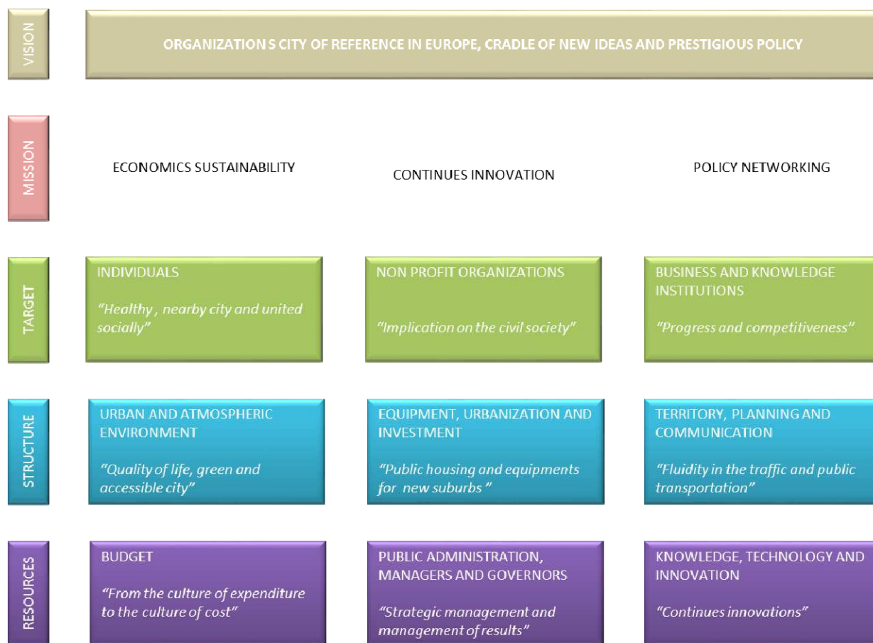
Fig. 1. BSC of Organization S