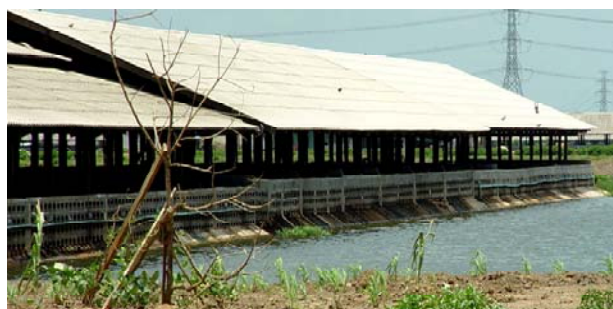
Fig. 3. Using pig waste as fish feed

1.2. Fish feed. Some farmers try to dispose of pig waste by creating large ponds, stocked with catfish, on their farms. Recycling pig waste in this way serves the dual purpose of protecting the environment and producing economic benefits from the sale of the fish. However, this alternative requires a large suitable piece of land to build the fish pond on. Moreover, the poor quality of the water means that only catfish can be bred. This alternative also requires considerable investment and labor and is generally inadequate in effectively disposing of the huge volume of waste produced by large farms.