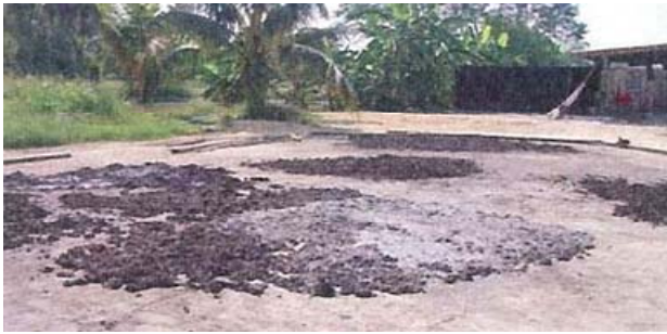
Fig. 4. Drying the waste before selling it as organic fertilizer

1.4. Deep pond. A small percentage of pig farmers, who have very limited spare land, dump their pig waste into a deep pond on their farms. These farms are always located away from the neighborhood, because the waste (which is left in the pond for years) gives off a very bad smell. Therefore, the local government has to enforce protective regulations on these farmers.