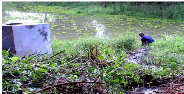
Fig. 5. Dumping the waste into a deep pond

1.4. Deep pond. A small percentage of pig farmers, who have very limited spare land, dump their pig waste into a deep pond on their farms. These farms are always located away from the neighborhood, because the waste (which is left in the pond for years) gives off a very bad smell. Therefore, the local government has to enforce protective regulations on these farmers.