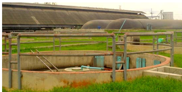
Fig. 2. Converting the pig waste into biogas by means of a concrete dome digester

normally give rise to. However, this method has had limited success (see Section 1.3).