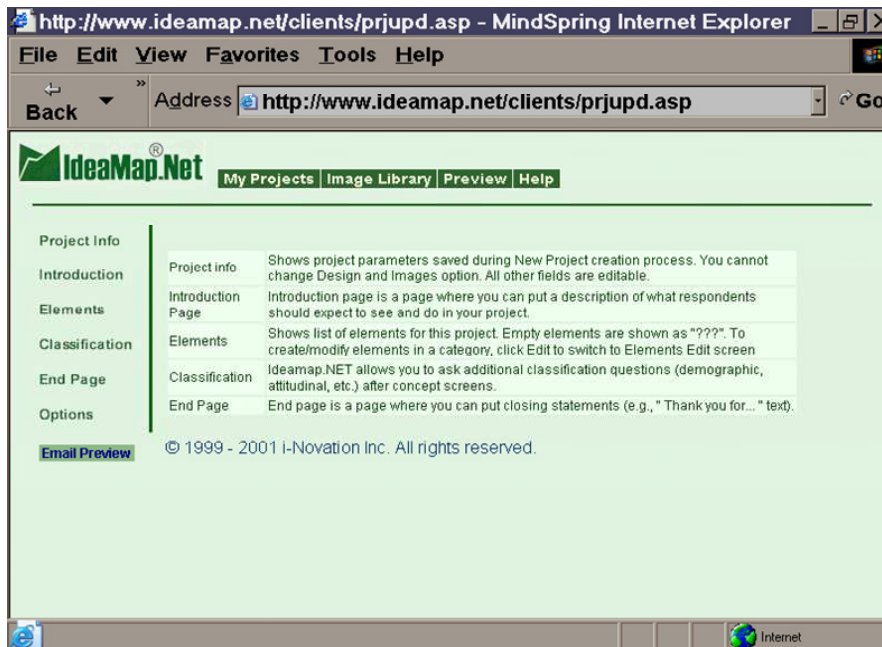
Fig. 1. Navigation bar for the conjoint analysis study

Figure 1 shows the navigation bar for the conjoint analysis. Through this bar the user can go through the different steps to set up a study.