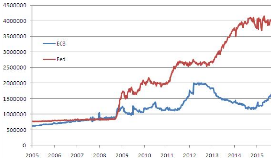
Fig. 2. Monetary base of the Fed and the ECB

three years. This is also the reason why the monetary base in the Euro area has fallen since the end of 2012, because the liquidity provided is repaid by the financial institutions. However, with the QE-program announced in January 2015 and its subsequent prolongings, the ECB balance sheet is expected to increase even further until the end of 2017.